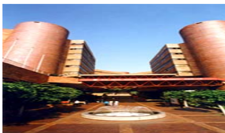
Fountain Square in the main entrance, PolyU

If you drive to the campus and need free parking, contact Sze-Wing Tang for parking coupons. Overnight parking is not allowed.